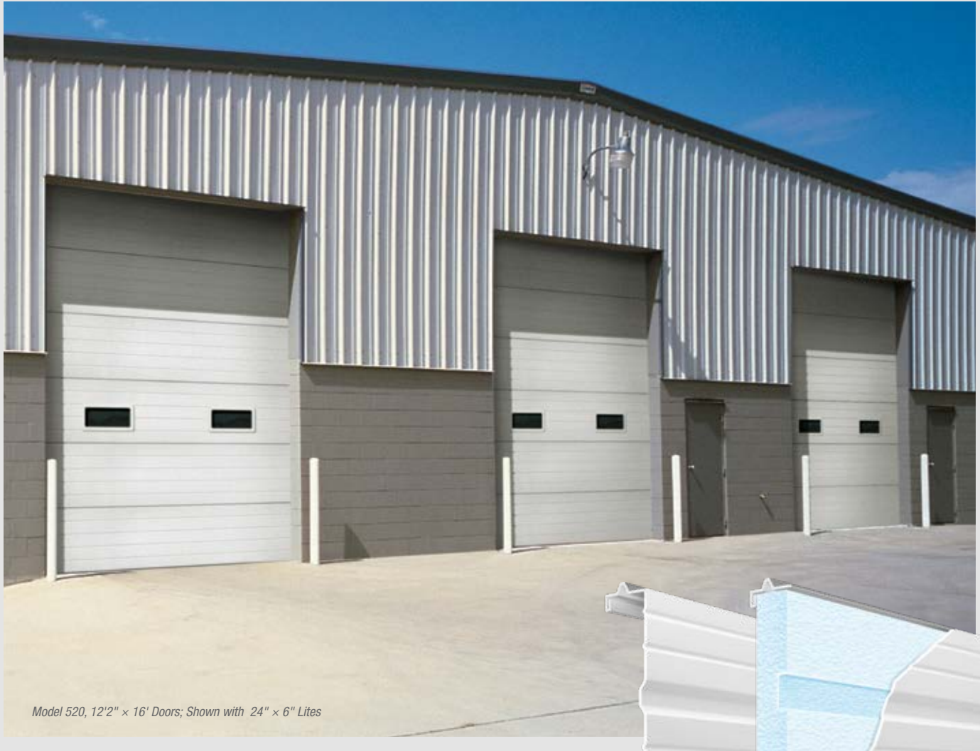
Model 520, 12'2" x 16' Doors; Shown with 24" x 6" Lites