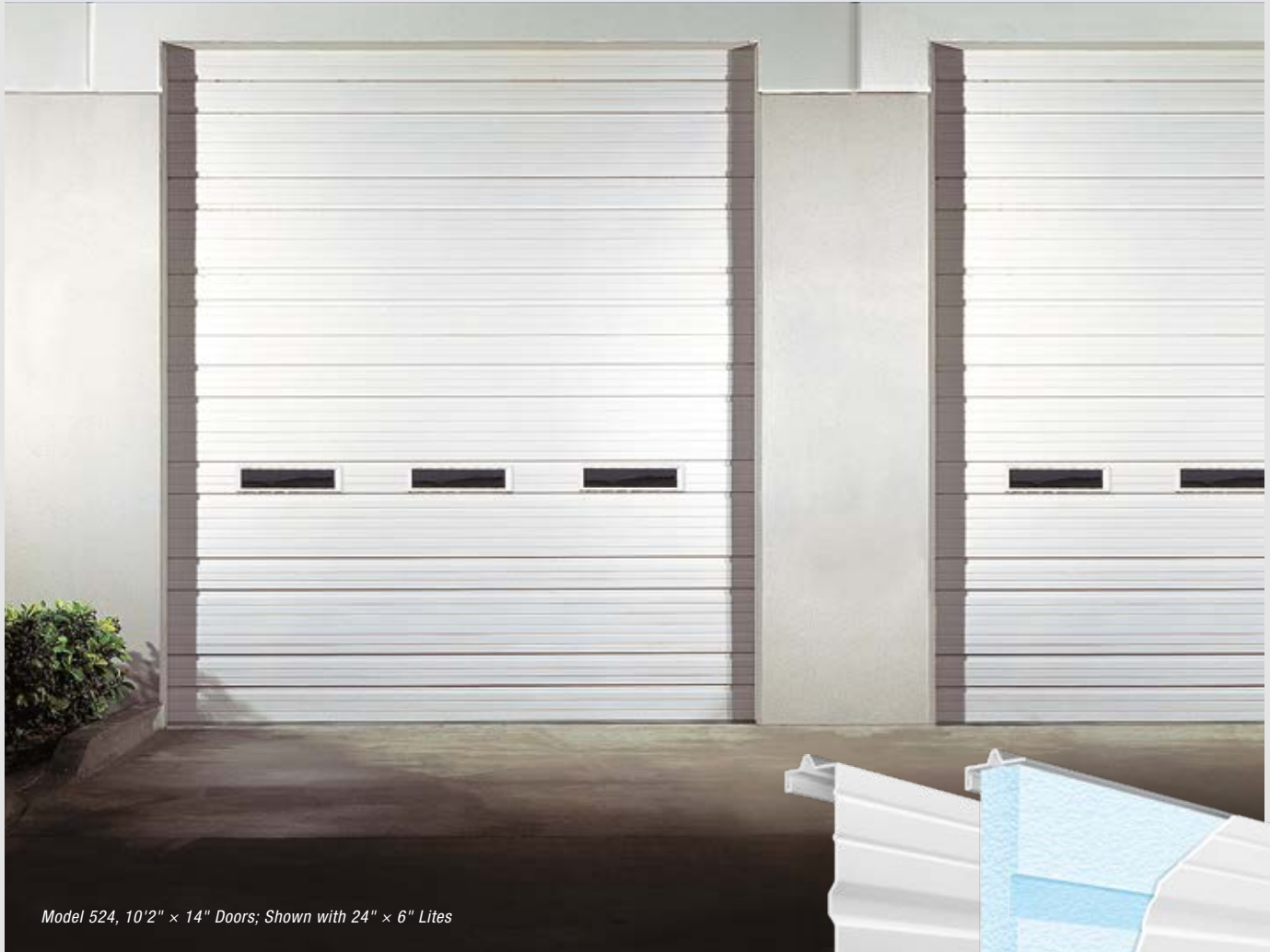
Model 524, 10'2" x 14" Doors; Shown with 24" x 6" Lites