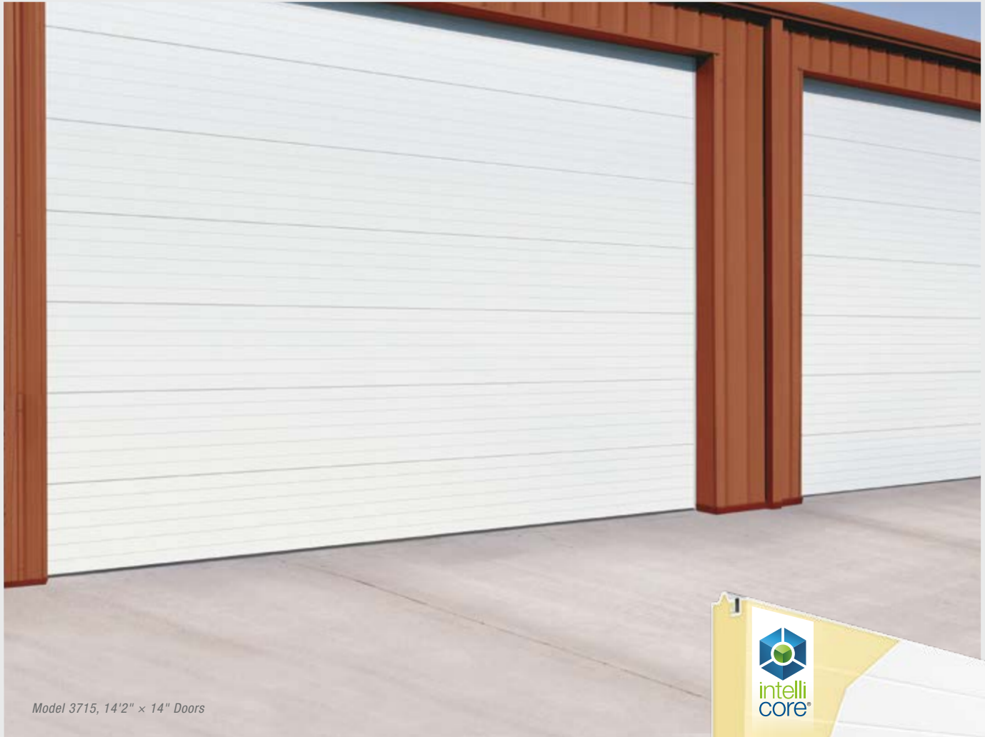
Model 3715, 14'2" x 14" Doors