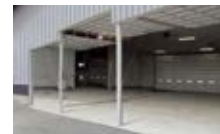
Carry-away, roll-away or swing-up mullions are available on select sizes.