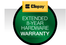
Increase the warranty with extreme duty hardware components.