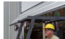
Single section and double sections available on select sizes.