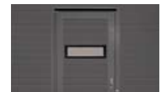
32" wide x 80" high, max 16'2" wide section.