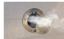
Can be cut into any type of sectional door. Available in select sizes.