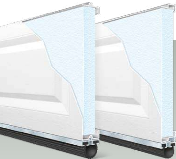
Tongue-and-Groove Section Joints

Improve your home's appearance and energy efficiency with a Clopay Value Plus insulated garage door. Available in 24 or 25 gauge steel with 1-5/16" polystyrene insulation, Value Plus models offer moderate insulating R-values, strength and security, as well as quiet operation and a beautiful appearance. Choose from two panel styles, many color options and a wide range of window options to create a door that fits your budget and enhances your home's curb appeal.