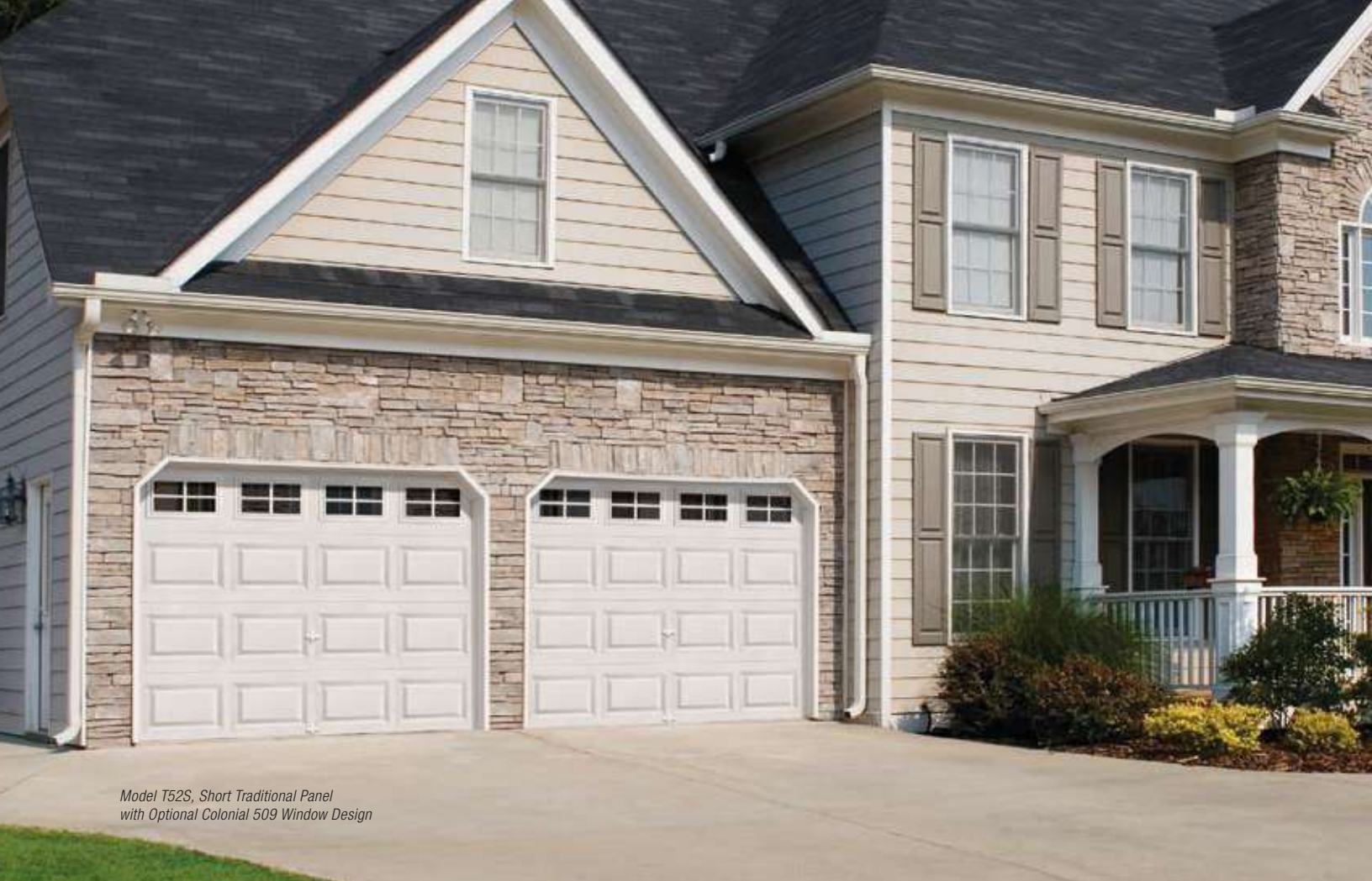
Model T52S, Short Traditional Panel with Optional Colonial 509 Window Design