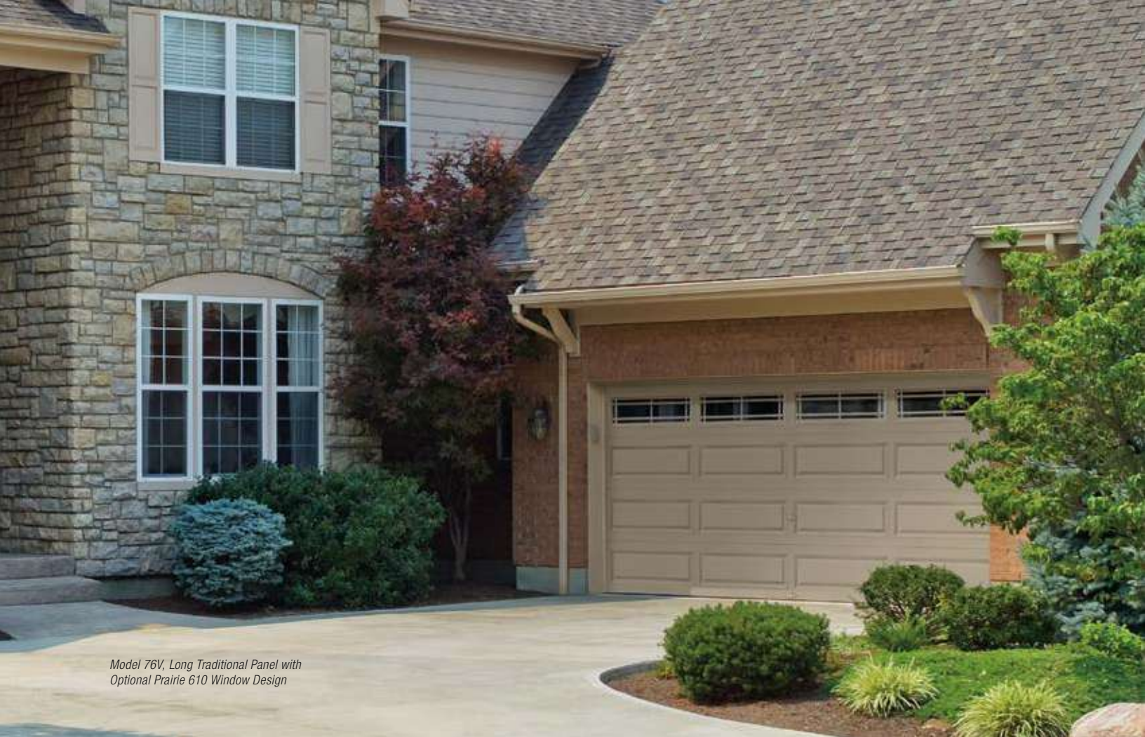
Model 76V, Long Traditional Panel with Optional Prairie 610 Window Design