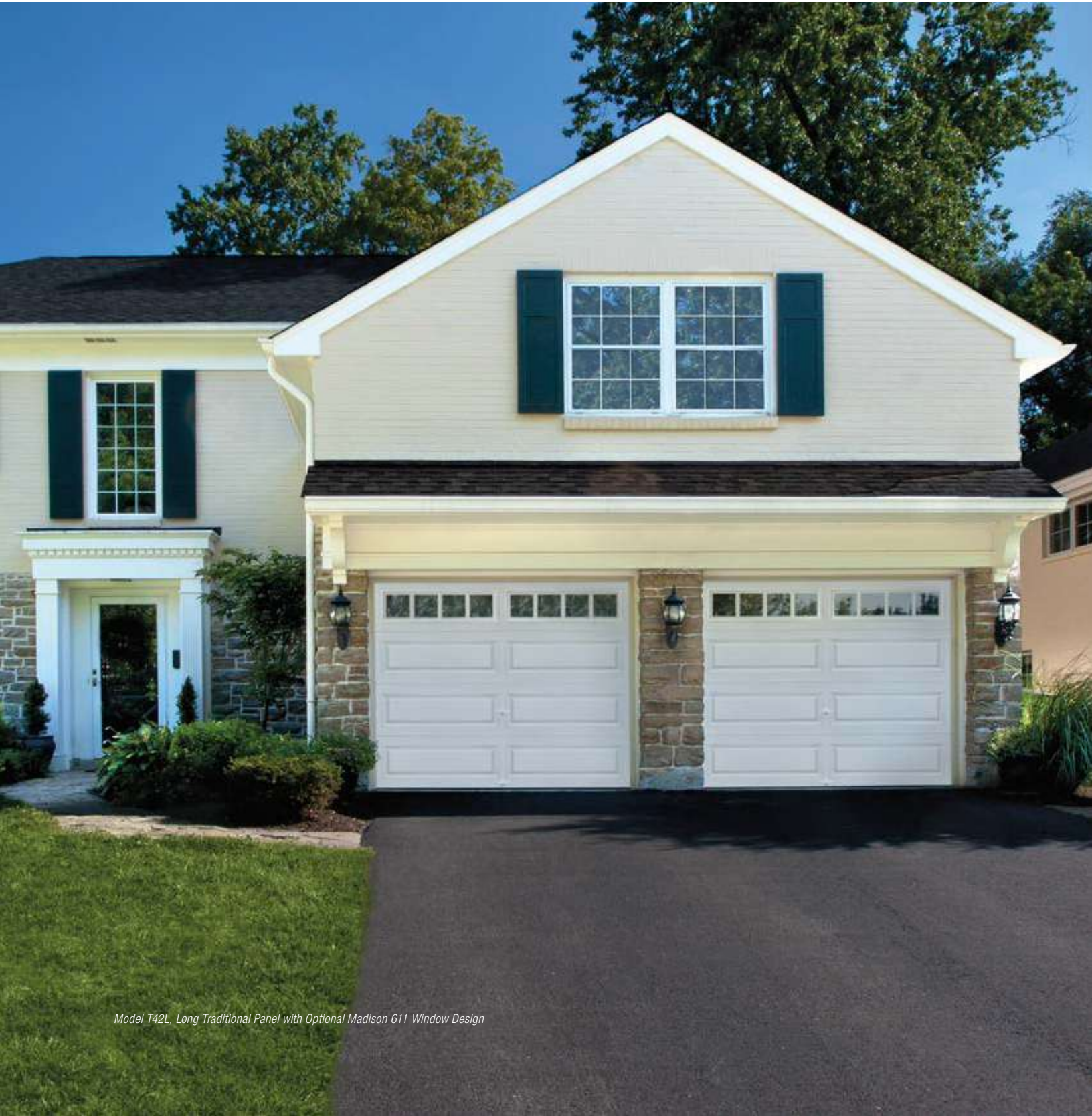
Model T42L, Long Traditional Panel with Optional Madison 611 Window Design