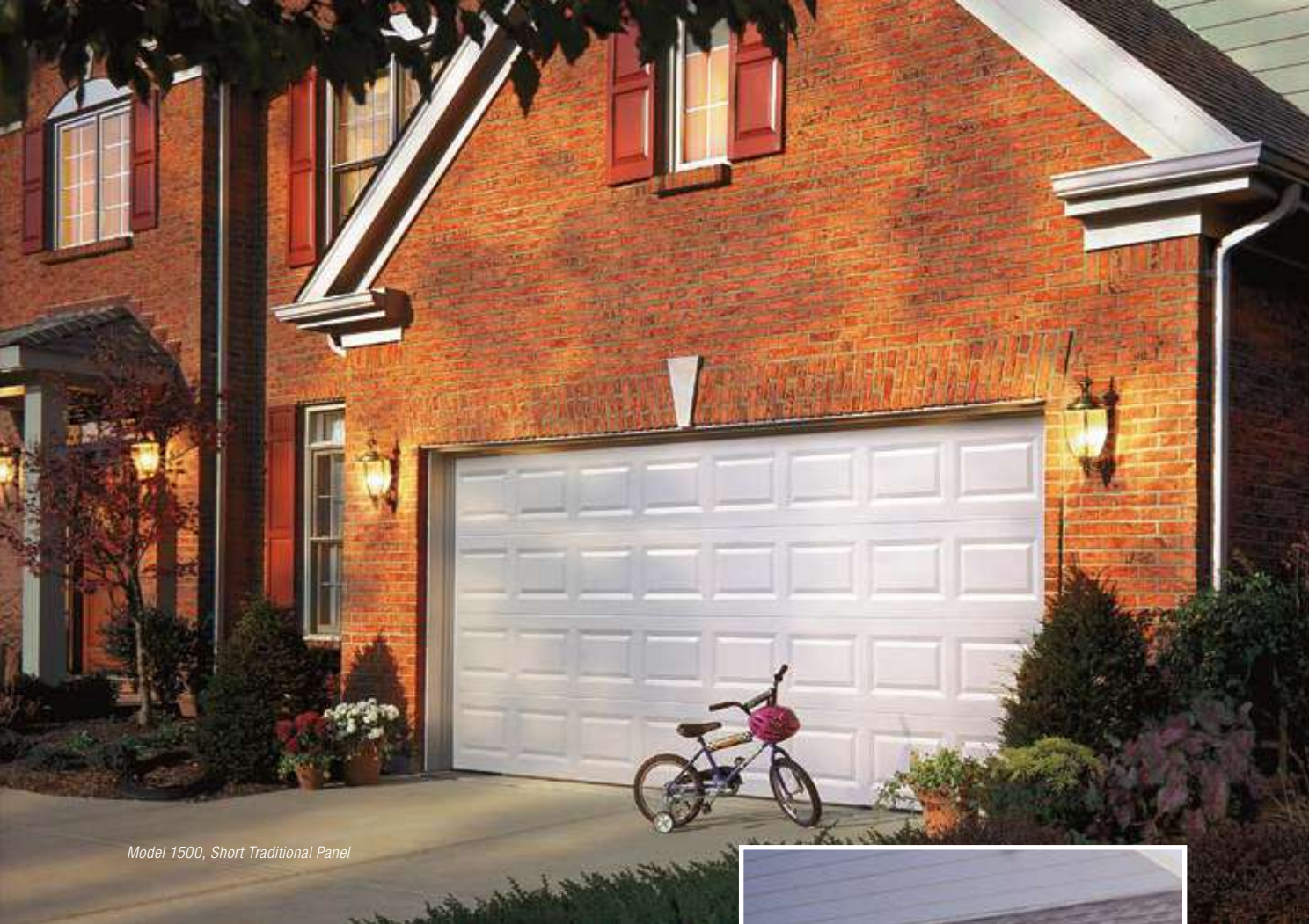
Model 1500, Short Traditional Panel