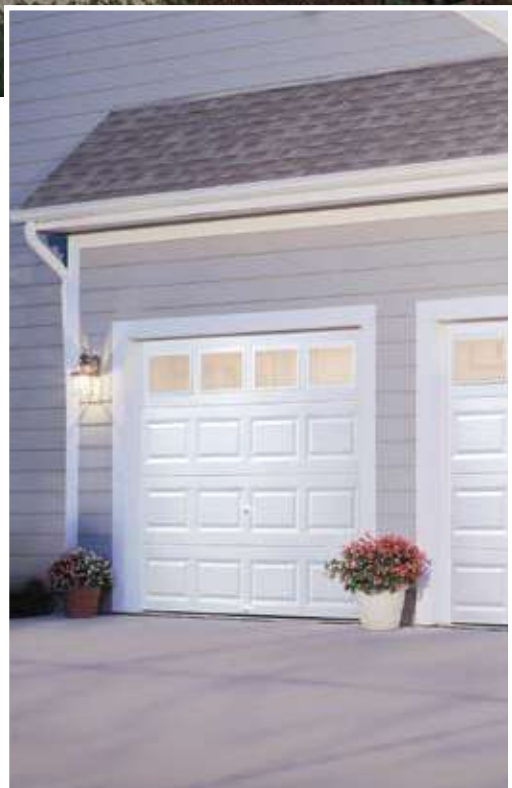
Model T42S, Short Traditional Panel with Plain Short Windows